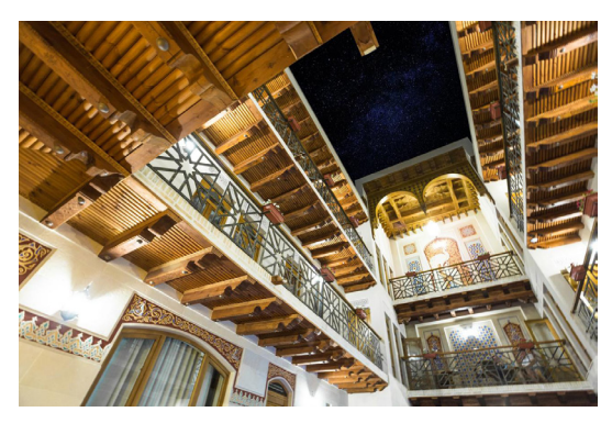
Safiya Boutique Hotel, Bukhara

We stay in carefully selected first class hotels, located in the historic centre of each town. All hotels have private facilities, TV, and WiFi. Hotels are traditional and decorated in typical style.