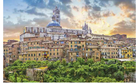
Historic city of Siena