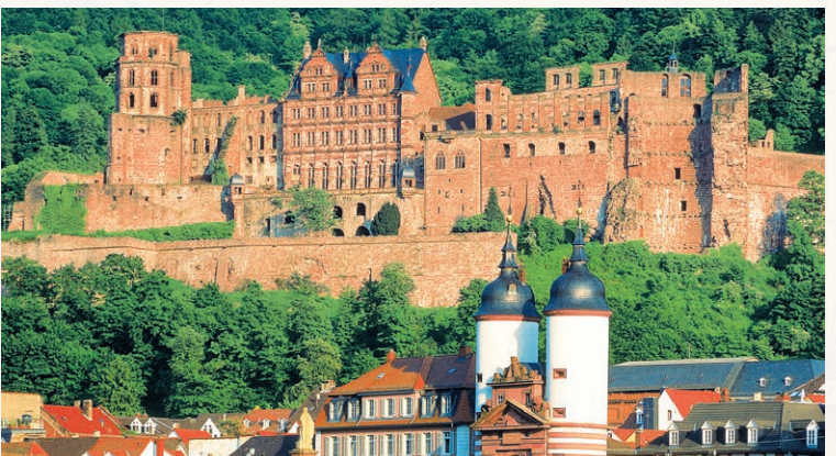
Heidelberg Castle, Germany

This extraordinary 11-day "Grand Tour" of Europe features an incredible combination of river, rail, lake and mountain travel including five nights aboard the deluxe AMADEUS SILVER III. Journey through the western heart of the Continent through Switzerland, France, Germany and the Netherlands, cruising the fabled Rhine River. Specially arranged guided excursions feature five great UNESCO World Heritage sites—see the Jungfrau-Aletsch region of the Swiss Alps, walk through Berne's Old Town, tour the Alsatian city of Strasbourg, cruise through the Rhine River Valley, and see Cologne's Gothic cathedral. Also visit Germany's medieval Rüdesheim and 13th-century Heidelberg Castle. Spend two nights each in Lucerne and Zermatt, Switzerland; ride aboard three legendary railways-the Pilatus Railway; the world's steepest cogwheel railway, the Gornergrat Bahn for breathtaking views of the Matterhorn, and the Glacier Express from Andermatt to Zermatt—and enjoy a scenic cruise on Lake Lucerne. This is the trip of a lifetime at an exceptional value! Complement your journey with the two-night Amsterdam Post-Program Option.