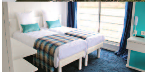
MS Gil Eanes