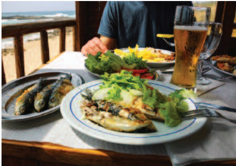
Traditional Portuguese fare