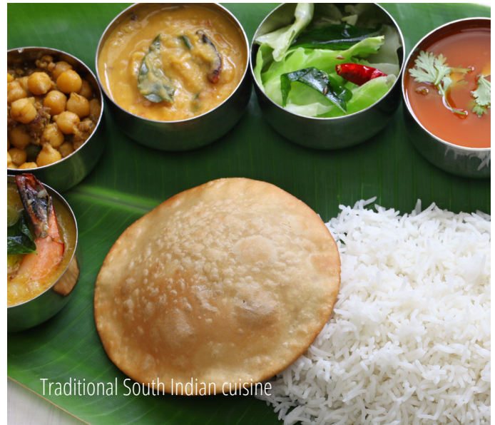
Traditional South Indian cuisine