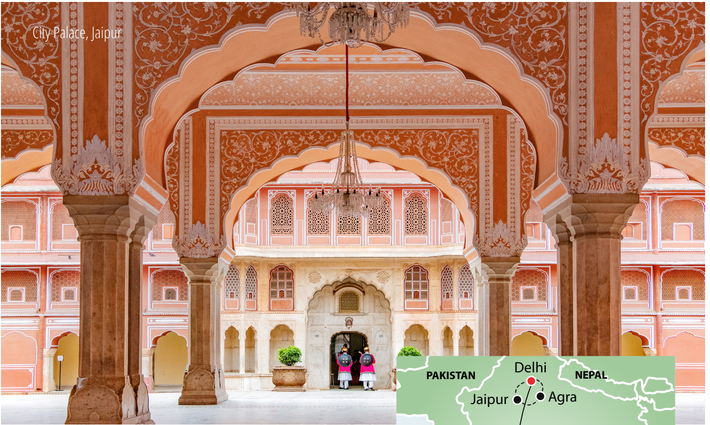
City Palace, Jaipur