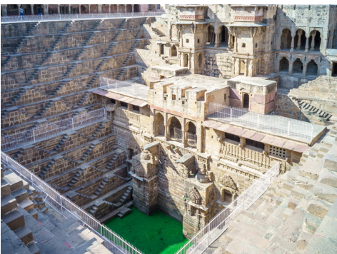
Stepwell in Abhaneri

Note: The itinerary and accommodation described in this tour brochure are subject to change due to logistical arrangements and to take advantage of local events.