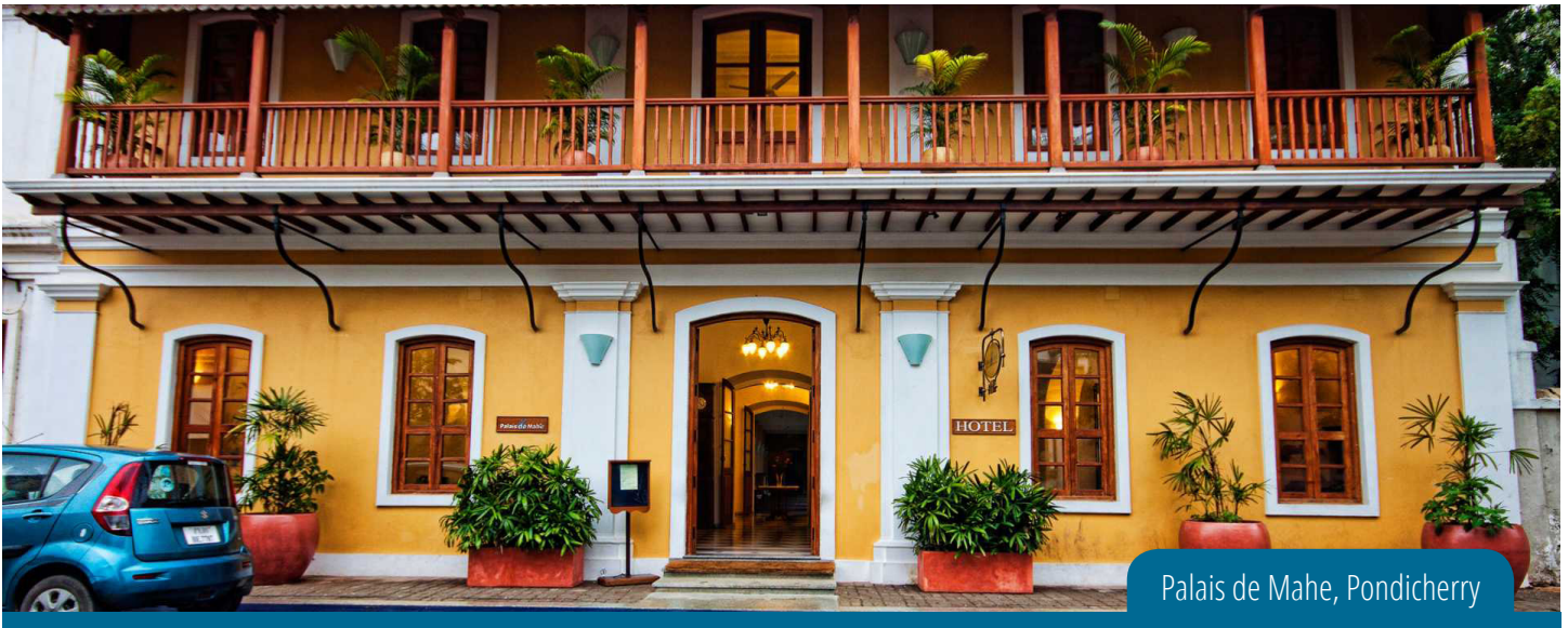
Palais de Mahe, Pondicherry