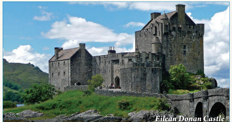
Eilean Donan Castle