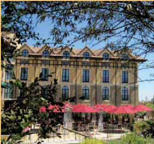
HOTEL VILLA DE LAGUARDIA SERCOTEL | LAGUARDIA