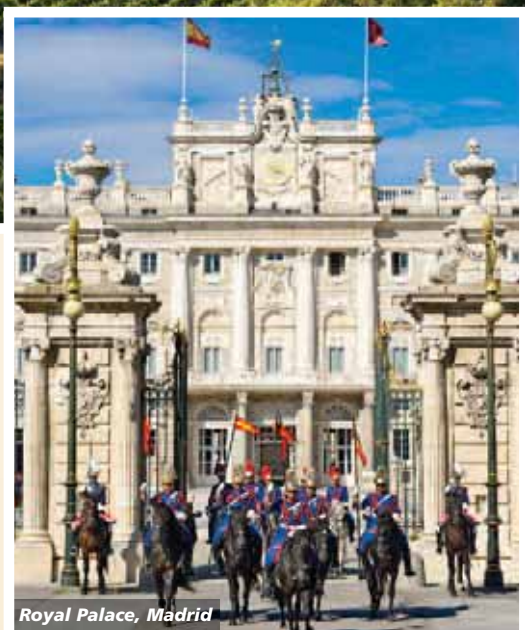
Royal Palace, Madrid