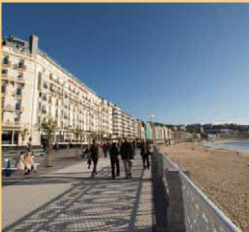
HOTEL DE LONDRES Y DE INGLATERRA | SAN SEBASTIÁN