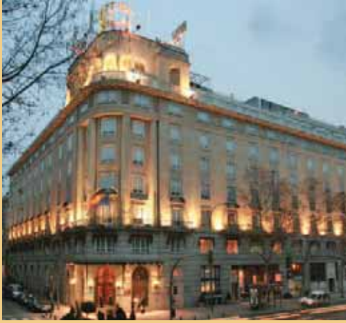
HOTEL WELLINGTON | MADRID