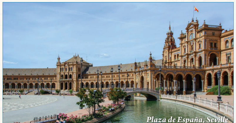
Plaza de España, Seville