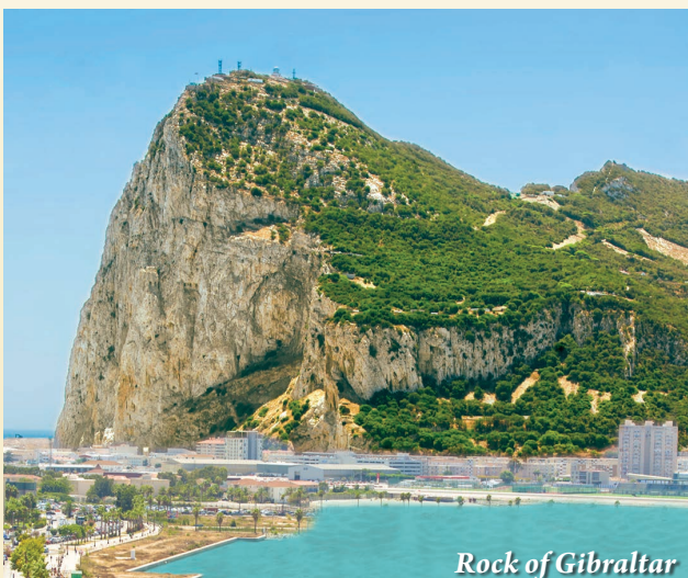
Rock of Gibraltar