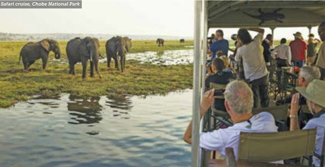
Safari cruise, Chobe National Park

The University of Toronto respects your privacy, your personal information remains confidential and is never released to our travel partners. The promotional information in this mailing is provided by an official travel partner of the University of Toronto. Revenue generated through travel programs support student and alumni events and initiatives. If you prefer not to receive information regarding the university's travel programs, please contact address.update@utoronto.ca or write to "Alumni Records - attn.: no travel mailings", 21 King's College Circle, Toronto, ON M5S 3J3