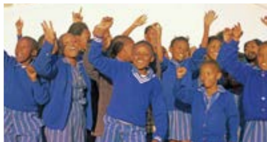
Soweto youth group