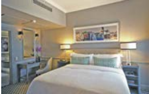
54 ON BATH | JOHANNESBURG