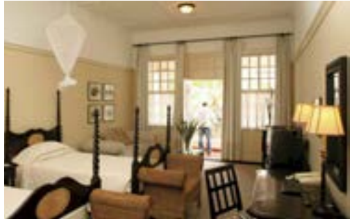
THE VICTORIA FALLS HOTEL | VICTORIA FALLS