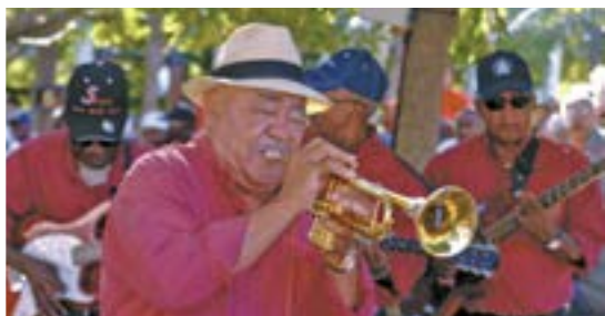
Musicians, Cape Town

Sheltered by Table Mountain, South Africa's Mother City is one of the world's most beautiful cities. Centuries-old Cape Dutch houses and colorful gardens dot the cityscape. A bustling waterfront welcomes visitors with inviting cafés and boutiques set amid workaday harbour life.