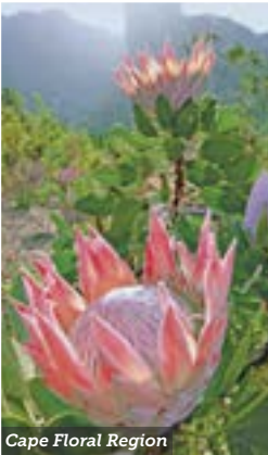
Cape Floral Region