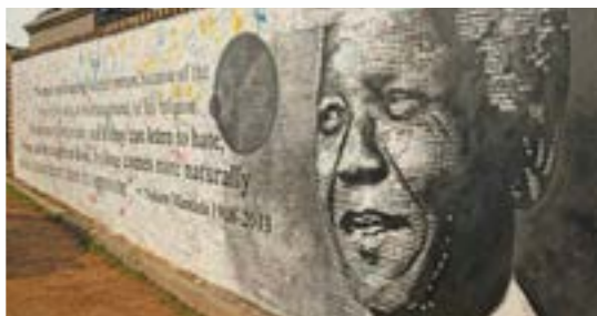
Nelson Mandela mural, Soweto

Until the 19th century, the Zambezi River's great cascade was called Mosi-oa-Tunya, "the smoke that thunders," by the local Kololo tribe. "Discovered" in 1855 by Dr. David Livingstone and renamed for England's queen, Victoria Falls spans more than a mile. Twice the height of Niagara Falls, mighty Victoria Falls casts a veil of spray that at times can be seen up to 50 miles away.