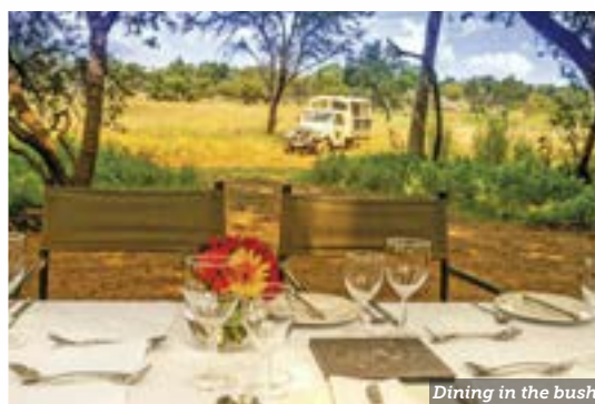
Dining in the bush

rambunctious brother. In 1886, the discovery of a huge lode of gold triggered a gold rush. Today, Joburg, as it is often called, is the country's financial centre, and many people come here to enjoy the fast-paced lifestyle.