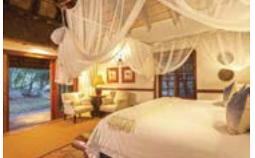
WATERSIDE LODGE | THORNYBUSH GAME RESERVE