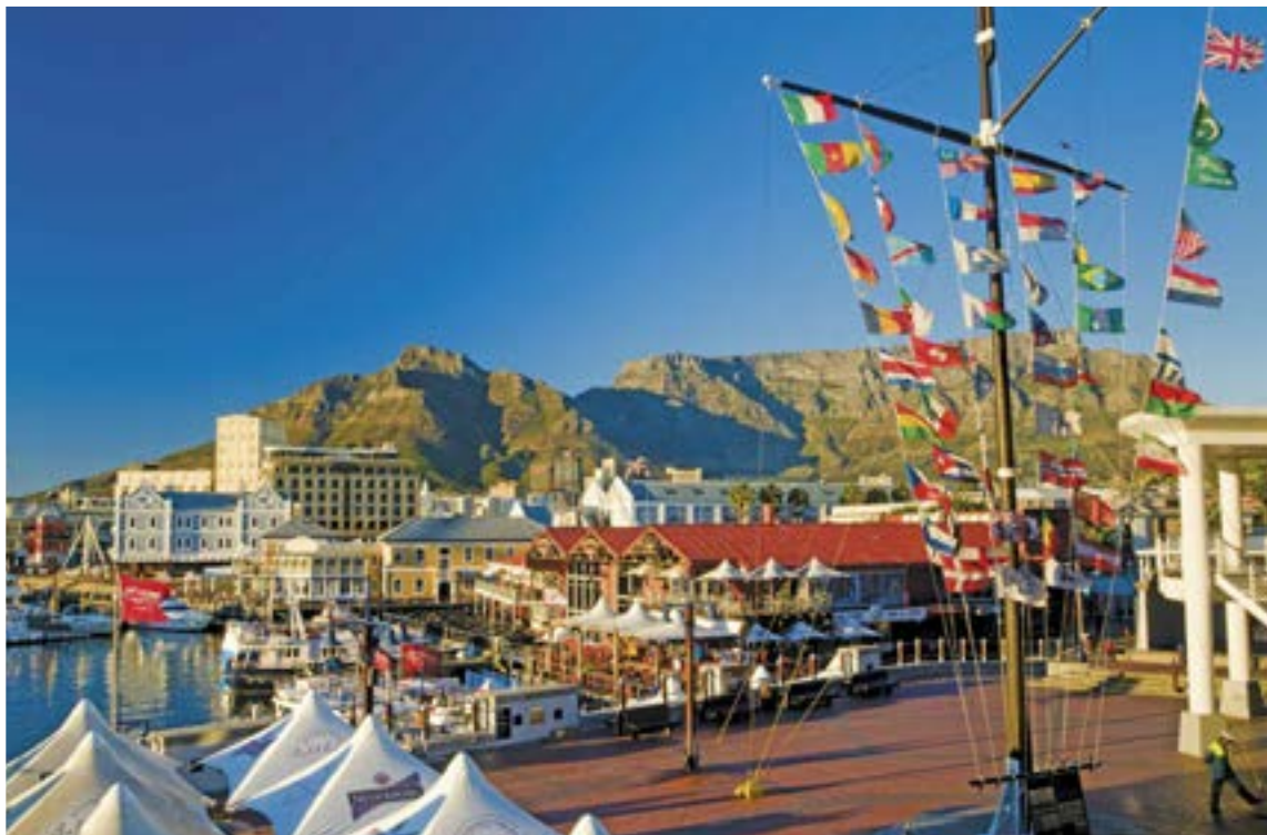
Victoria and Albert Waterfront, Cape Town

Discover the rich natural and cultural heritage of southern Africa. Cape Town is a showcase of Cape Dutch houses and inspiring landmarks, including Robben Island and St. George's Cathedral. Across the country, Soweto, once the main battleground in the war on apartheid, now offers opportunity and hope for a better future. No trip to southern Africa would be complete without a safari in its greatest parks and game reserves. Experience the thrill of up-close encounters with lions lazing in the grass after a kill or elephants quenching their thirst by a watering hole, and feel the power of thundering Victoria Falls.