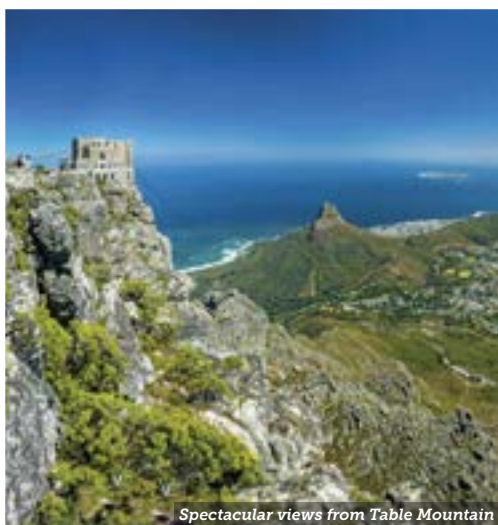
Spectacular views from Table Mountain