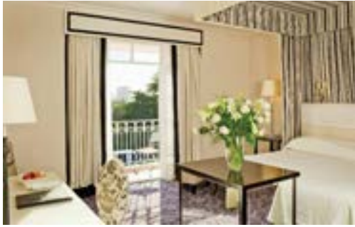
BELMOND MOUNT NELSON HOTEL | CAPE TOWN