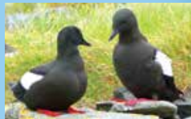
Spot black guillemots resting on the shore and cliff faces.

Clinging to the foot of steep mountain walls at the entrance to a gorgeous fjord, charming Siglufjörður is one of Iceland's most dramatically sited towns. Multicolored houses lead to a bustling harbor, the hub of the town's fishing industry. Siglufjörður celebrates the glory days of herring fishing at the award-winning Herring Era Museum, which recreates the history of fish salting and oil processing during the early 20 th century.