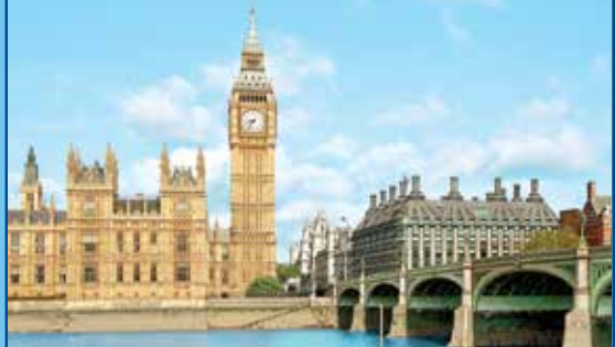
The Parliament, neighbored by 19 th -century Big Ben, was strategically built on the River Thames in 1016.

Resplendent palaces, magnificent churches and pastel-hued houses stand in testament to Lisbon's rich cultural heritage and quintessential charm. A historic gateway for world exploration and Portugal's intimate, welcoming capital, Lisbon is the ideal prelude to your cruise. Visit the UNESCO World Heritage sites of 16 th -century Jerónimos Monastery and the nearby forested village of Sintra, where the former Moorish fort is Portugal's last remaining medieval royal palace. Accommodations are for two nights in the deluxe DOM PEDRO PALACE HOTEL.