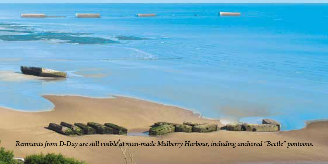
Remnants from D-Day are still visible at man-made Mulberry Harbour, including anchored "Beetle" pontoons.

The University of Toronto respects your privacy, your personal information remains confidential and is never released to our travel partners. The promotional information in this mailing is provided by an official travel partner of the University of Toronto. Revenue generated through travel programs supports student and alumni events and initiatives. If you prefer not to receive information regarding the university's travel programs, please contact: address.update@utoronto.ca or write to "Alumni Records - attn.: no travel mailings", 21 King's College Circle, Toronto, ON M5S 3J3.