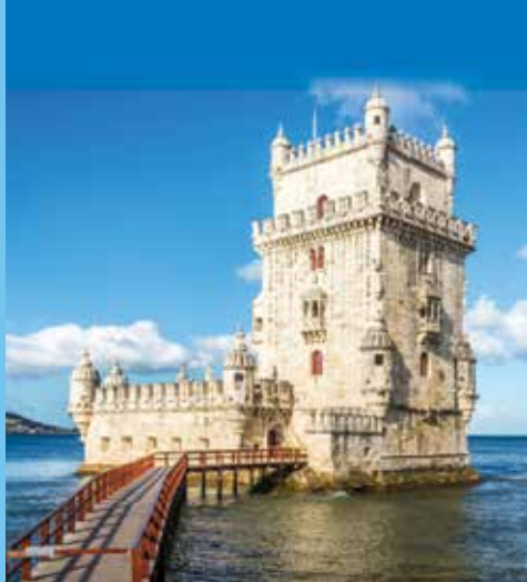
From the iconic 16 th -century Tower of Belém, in the Tejo Estuary, watchmen surveyed Lisbon's harbour.

enshrines the tomb of St. James and is recognized for its Baroque façade, original medieval portico and glittering Churrigueresque altar.