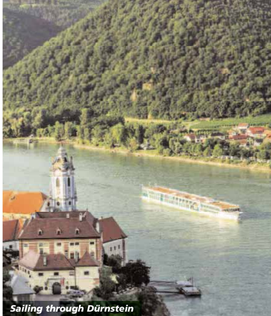
Sailing through Dürnstein