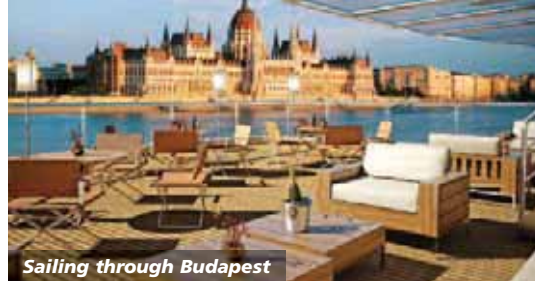
Sailing through Budapest