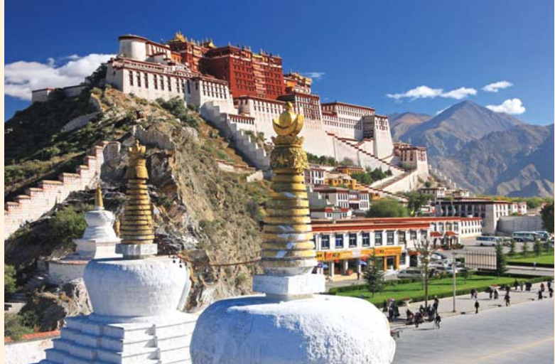
Commissioned by the fifth Dalai Lama, the landmark Potala Palace served both as a spiritual site and bureaucratic complex for the Tibetan government.

Further up the mountain, visit the stunning chapels in the Red Palace, where opulent, jewel-laden monuments honour previous Dalai Lamas.