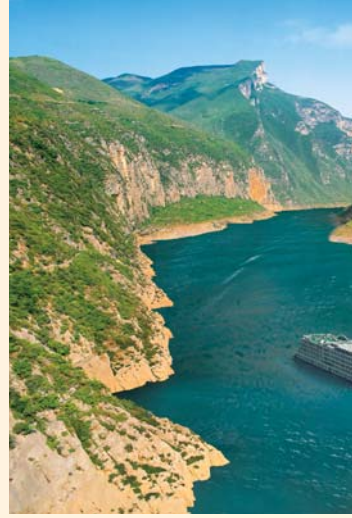
Cruise the scenic waterway carved by the heart of China, an exotic landscape of sheer cliffs.

Visit the amazing UNESCO World Heritage site of the famous life-size Terra Cotta Warriors, no two alike.