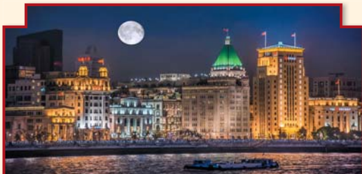
Stay in Shanghai’s historic FAIRMONT PEACE HOTEL, whose pyramid-shaped roof is a landmark of the Bund skyline.

Pass through Kui Gate, the soaring twin peaks that mark the gateway to Qutang, the most dramatic of the Three Gorges. Admire the quiet beauty and sheer white-stone cliffs of stunning Wu Gorge, where the legendary Twelve Peaks look down