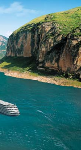
...the Yangtze River through ...of verdant mountains and