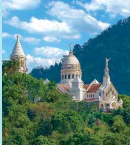
Martinique's Sacré Coeur is the miniature twin of its sister hilltop church in Paris.

Visit the Old Hegg Turtle Sanctuary, dedicated to raising and safely releasing endangered hawksbill sea turtles.