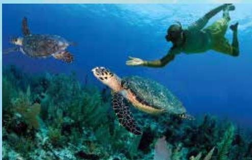
Snorkel among peaceful hawksbill sea turtles in the clear-blue waters of the Grenadines.

From the verandah of a Creole farmhouse in the famous Balata Gardens, watch effervescent hummingbirds feed on sweet nectar. Then, wind through a shaded canopy of trees, including twining begonias, mahogany, musa nana and bamboo, and around the 3000 varieties of its tropical plants. In the St. Pierre Volcanological Museum, see artifacts excavated from the petrified ash of Mount Pelée.