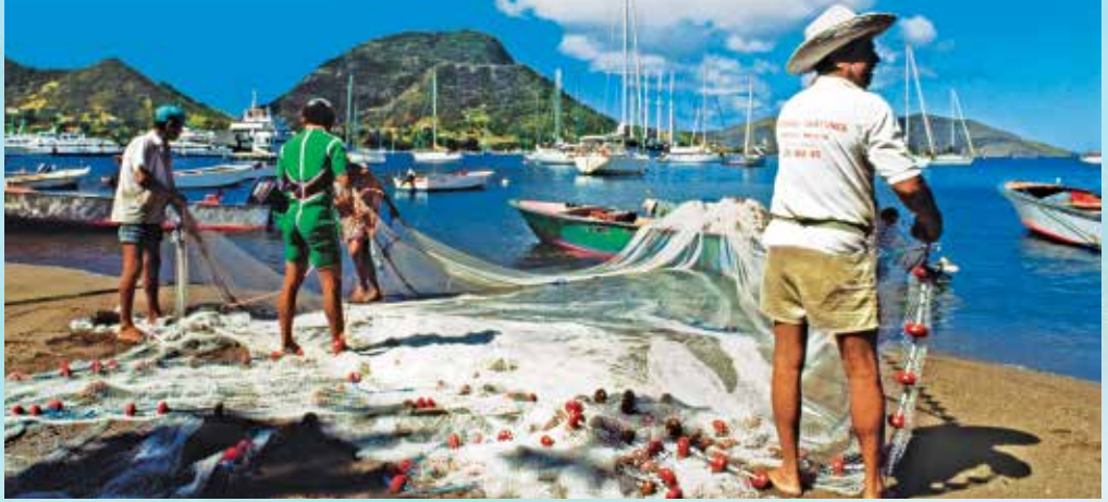
Island fishermen ready their nets for catching some of the most popular fresh fish in the Caribbean.

French President François Mitterrand and U.S. President George H. W. Bush.