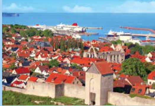
Visby's medieval wall, constructed in the 13 th century, stretches 3.2 kilometres in length around the town.

One of the world's greatest art repositories, the UNESCO World Heritage-designated museum was the former palace of Catherine the Great. Its prestigious collections are rivalled only by the museum's lavish interior.