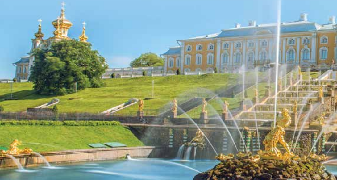
Photo this page: Peter the Great himself partially engineered the resplendent plexus of waterfalls, fountains and statues that adorns the foreground of the opulent Grand Palace at Petrodvorets.

Cover photo: Spanning 14 small islands, where shimmering Lake Mälaren meets one of the largest archipelagos in the Baltic Sea, Stockholm preserves its medieval and Renaissance architecture.