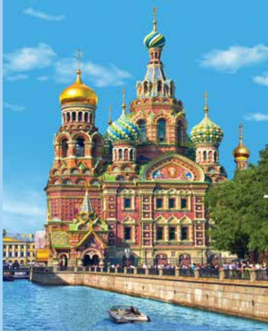
St. Petersburg's Church of the Resurrection of Christ is a showcase of neo-medieval Russian architecture.