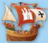
Hanseatic Cog Ship