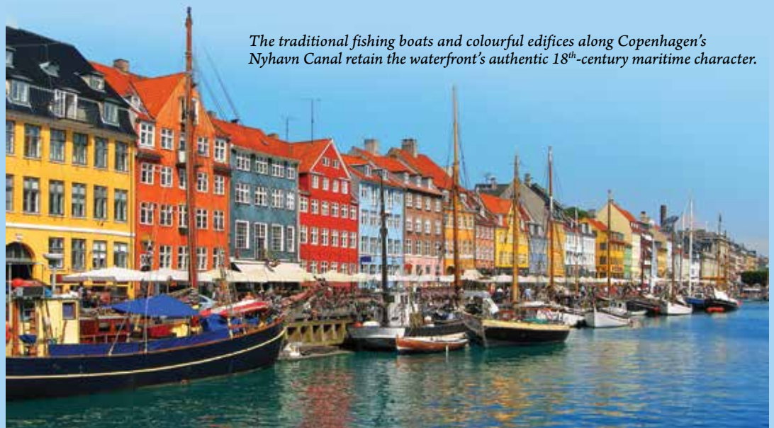
The traditional fishing boats and colourful edifices along Copenhagen's Nyhavn Canal retain the waterfront's authentic 18 th -century maritime character.

In 1980, shipyard workers led by Lech Wałęsa founded the Solidarity movement, the first independent trade union in Eastern Europe and key to winning Poland's struggle against Communism.