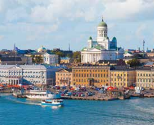
Finland's capital city of Helsinki showcases elegant Jugendstil architecture along its picturesque harbour.