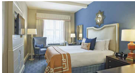
Providence Biltmore Hotel