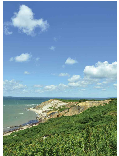
Martha's Vineyard cliffs