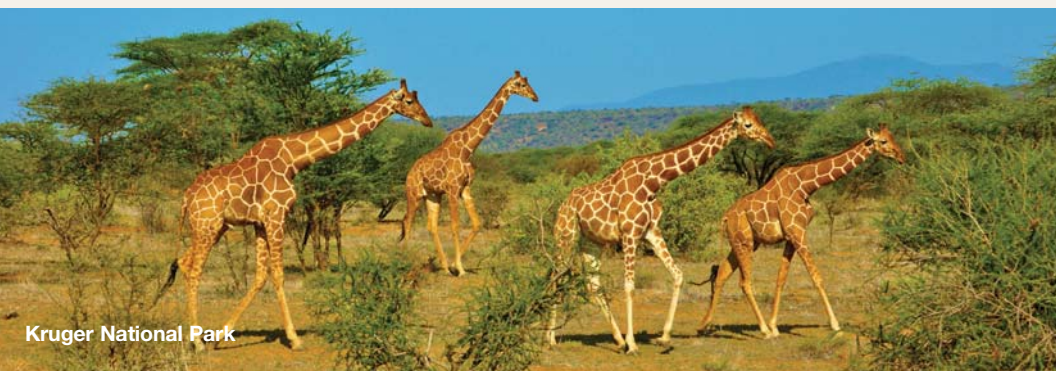
Kruger National Park

HOTEL AND SIGHTSEEING ARE SUBJECT TO CHANGE.