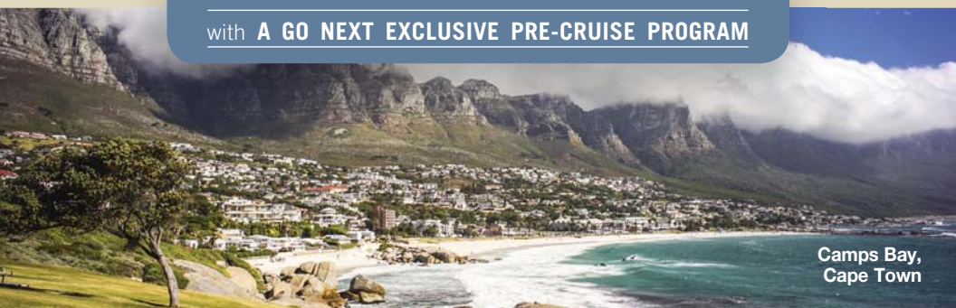
Camps Bay, Cape Town

with A GO NEXT EXCLUSIVE PRE-CRUISE PROGRAM