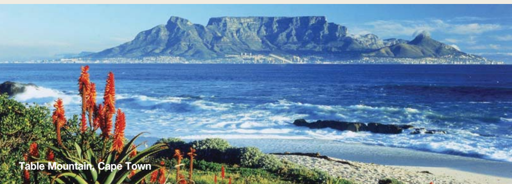
Table Mountain, Cape Town

CALL FOR ADDITIONAL INFORMATION 800.842.9023 OR 952.918.8950 FAX: 952.918.8975 • WWW.GONEXT.COM