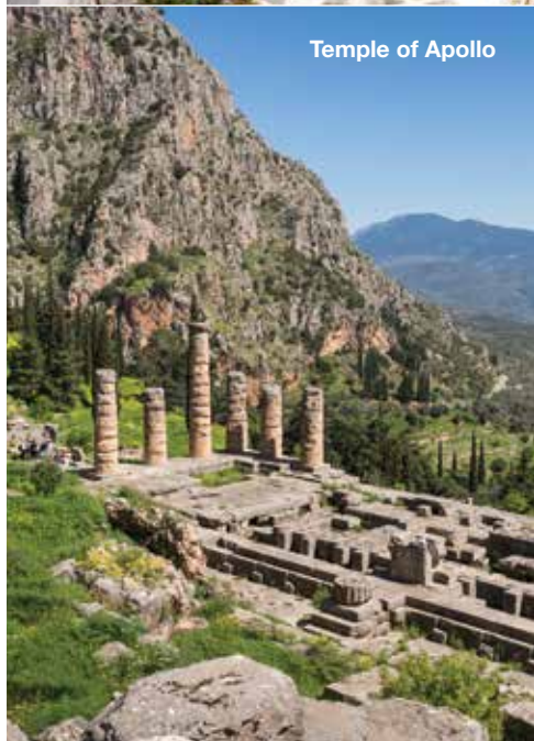
Temple of Apollo