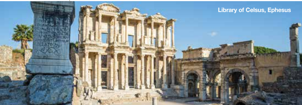
Library of Celsus, Ephesus

Oceania Cruises may modify the cruise itinerary up to and during the voyage. Air arrangements, cruise accommodations, local transportation, and optional shore excursions are arranged by Oceania Cruises, which may use other suppliers or providers to render the services.